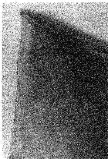
Fig. 3. Enlargement of apical section of Fig. 2 showing dye penetration from both the cleaned root canal face and the canal wall of the preparation. Original magnification \times 18 .

amalgam plugger which would have had the same effect. Although two studies have reported the efficacy of using EBA cement as a root-end filling further in vivo studies are required to ascertain long-term performance of this material.