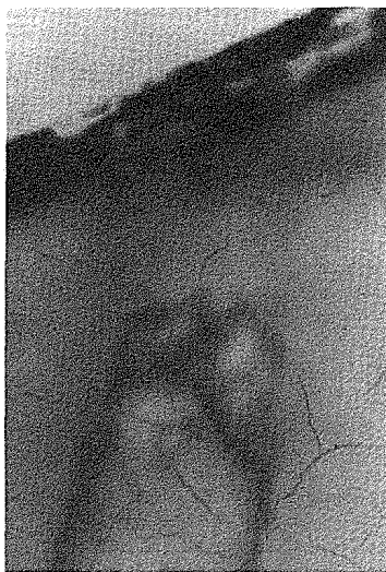
Fig. 1. Cracks seen in the root structure following ultrasonic root-end preparation. Original magnification \times 25 .

The sealing ability of the EBA cement deteriorated with time, with significantly more leakage after 7 months. If good healing and adaptation of the periapical tissues takes place within this time then, provided that the coronal seal of the root filling remains intact, the increased leakage may not be of clinical significance. Oynick & Oynick (1978) reported a clinical study where EBA had been used as a retrograde filling material in 200 cases over a 14-year period. Sixty of these cases were recalled and the success rate was considered to be high. Dorn & Gartner (1990) stated that it was important to burnish the margins of the EBA with a ball burnisher to improve adaptation. In the present study the cavity was packed using a round-tipped