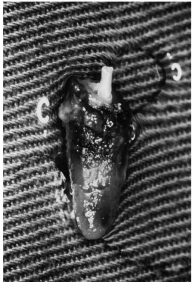
Fig. 4. The fractured root was bonded extra-orally using 4-META/MMA-TBB resin. A gutta-percha point was inserted into the root canal in order to guide the post preparation.