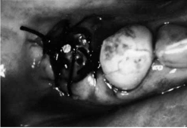
Fig. 5. The replanted root was sutured in the gingiva and then fixed to the proximal tooth with 4-META/MMA-TBB resin.

cast crowns, 5 with full-cast crowns splinted to fixed bridges and 2 with copings 2–4 months after the replantation (Table 1).