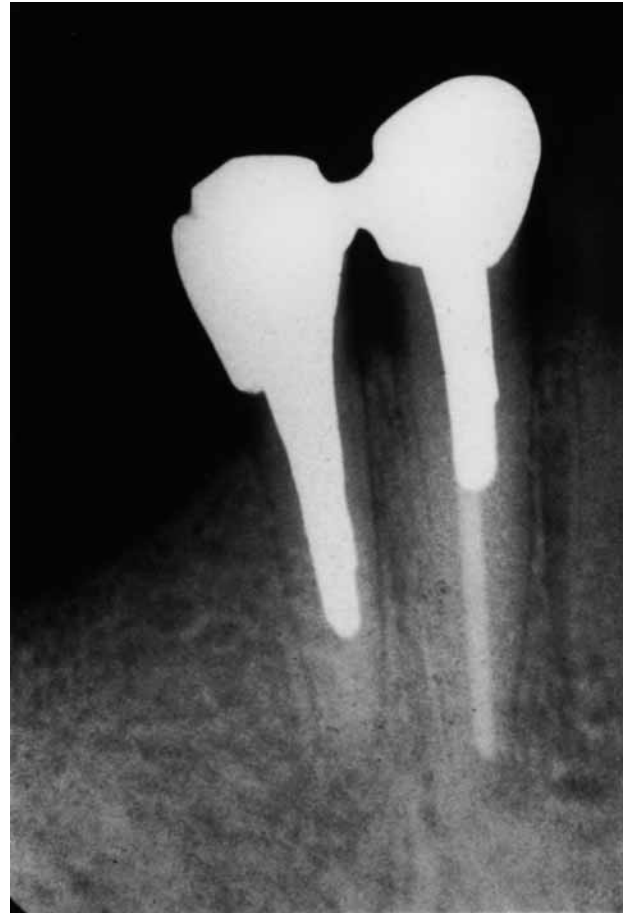
Fig. 1. Pre-treatment radiograph of mandibular right first premolar with vertical root fracture shows no bone loss.

The radiographic bone level was assessed by the following ratio: distance from the root apex to the