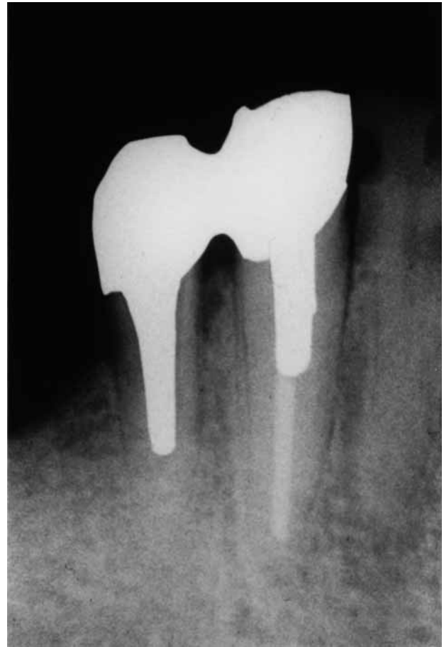
Fig. 6. Five years later. Radiograph shows no bone loss. The probing depth was 3 mm.

The mean probing depth along the fracture sites at pre-treatment (7.42 mm) decreased significantly at 6 months after the treatment (4.58 mm) ( P < 0.01 , Wilcoxon signed-rank test) (Table 2). Bleeding was demonstrated at 91.7% of the sites on probing at pre-