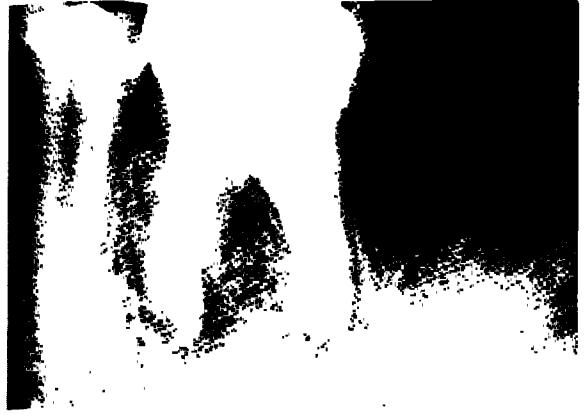
Fig 5—Radiograph taken Dec 15, 1976, shows sclerotic bone around mandibular right first molar and shows completed root canal filling.

is particularly true if the patients are treated bilaterally in areas involving the muscles of mastication. They should be instructed to do exercises so that they will not lose interarch space.<sup>1</sup> This will not only help the patient eat and talk better, but will be of real value to the endodontist should he have to treat this patient several years later.