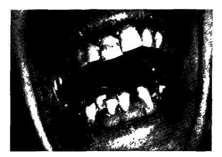
Fig 2—Maximum extent that patient could open his mouth after months of facial exercise.

treated first; when he could open his mouth 21 mm in the anterior area and 16 mm in the posterior area, the three posterior teeth were treated (Fig 2). Because the endodontic procedures were very tiring to the patient, several weeks of rest were taken between treatments of different teeth. It was not until Dec 15, 1976, that the final endodontic treatment was completed (Fig 3). Fluoride applicators were constructed and are now in use. Restorative dental treatment has been completed. He will be recalled at six-month intervals for further examination.