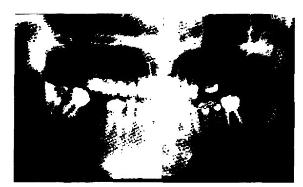
Fig 3—Radiograph taken Dec 15, 1976, shows completed endodontic treatment of six teeth.

Fortunately, this patient cooperated with exercises and eventually was able to open his mouth wide enough for treatment. He refused to try mechanical methods of prying his mouth open, however. In the posterior area, 16