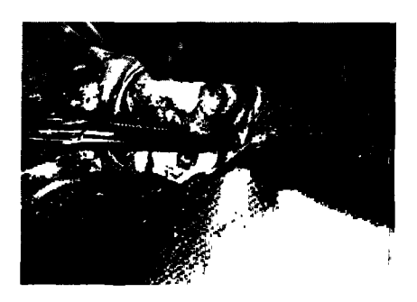
Fig 4—Instrumentation performed with hemostat because of limited work space.

mm is not much room to work and the patient could keep his mouth fully opened for only short periods. My forefingers are 9 mm thick: therefore, it was necessary to cut the molar crowns off on the buccal surfaces at the gingivae so enough room could be created to work. Short (21 mm) files were used-the handles cut downand all instrumentation was done with the files held in the beaks of a hemostat (Fig 4). Because of trismus in this case and the secondary dentin in the pulp chamber and canals, the mesial canals of the mandibular molars were very difficult to instrument.