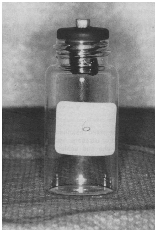
FIG 2. Debris collection assembly mounted on a 20-ml scintillation vial.