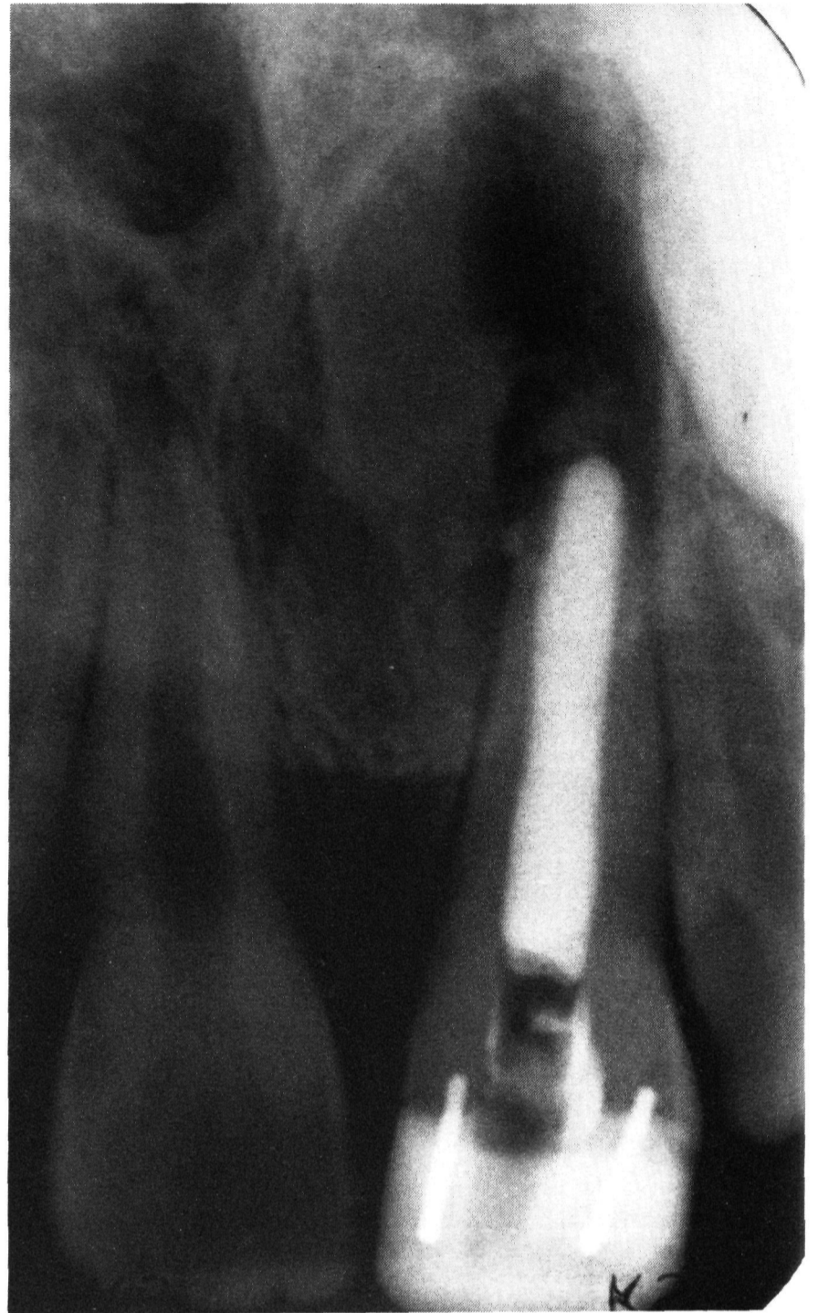
Fig. 4. Same case as in Fig. 1 showing postobturation radiograph. The canal was filled with vertically condensed warmed gutta-percha. The radiolucent lesion has not resolved but an apical barrier has formed.

Table 2 compares 4 clinical variables found in patients who developed painful interappointment symptoms to those who did not develop symptoms. Statistically significant differences existed between