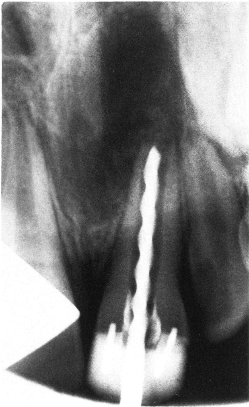
Fig. 3. Same case as in Fig. 1 showing an endodontic file probing the apical barrier.

treated, 16 became discolored and required endodontic bleaching after completion of apexification. There were 19 females and 29 males. Sex difference had no effect on the clinical variables studied. Trauma was responsible for pulpal necrosis in all the incisor teeth in both sexes with the exception of one lateral incisor that became necrotic because of a dens in dente malformation. All of the molar teeth required treatment because of caries. Twenty-six teeth had an associated radiolucency. Nine patients developed painful interappointment symptoms during treatment that required an unplanned office visit. All cases eventually formed an apical hard tissue barrier allowing completion of endodontic therapy and no case required periapical surgery or extraction. Table 1 shows other descriptive data for the patients in this study.