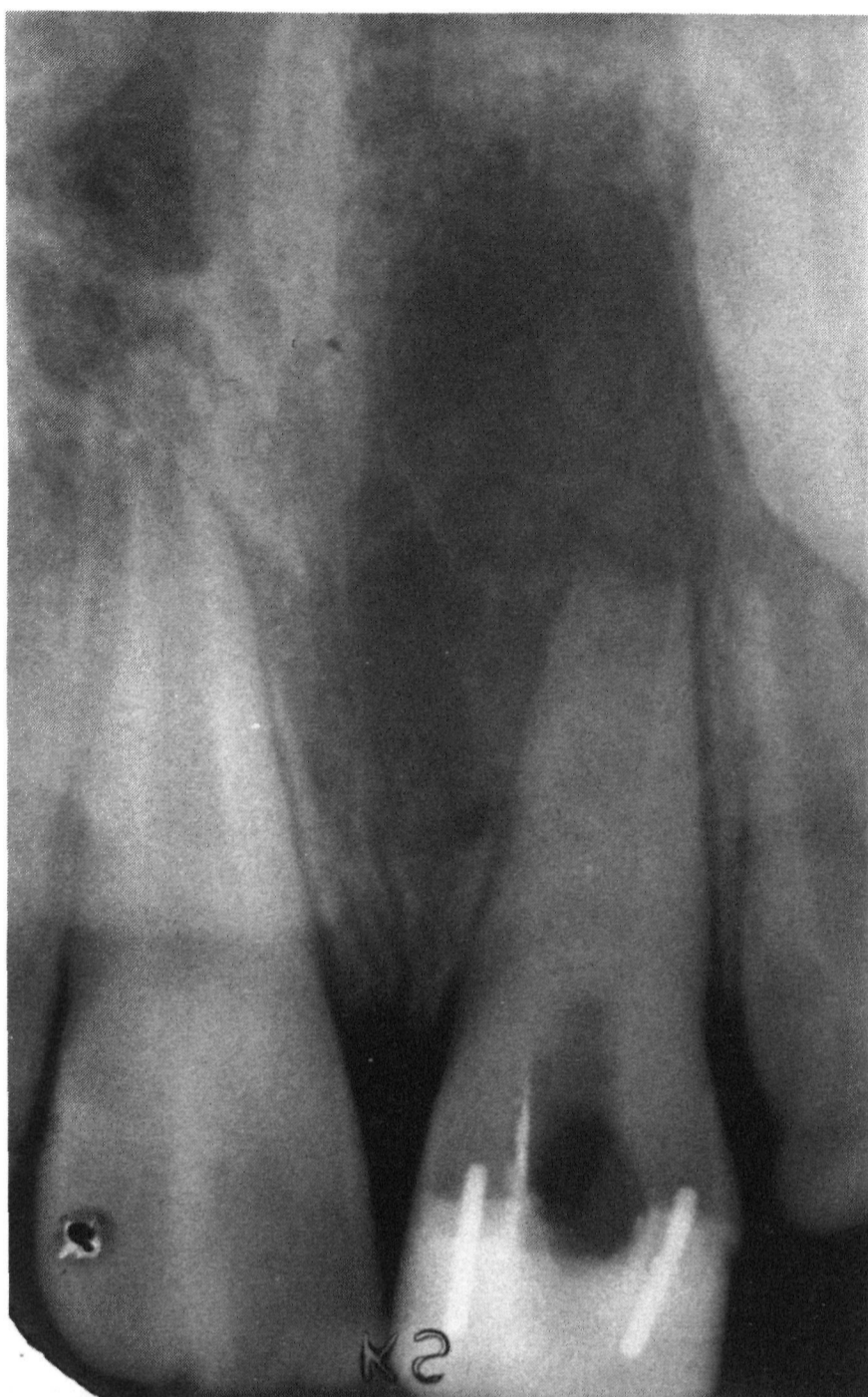
Fig. 2. Same case as in Fig. 1 showing canal filled with calcium hydroxide paste.

The calcium hydroxide was replaced every 3 to 6 months as a routine until the apex was closed. Root-end closure was determined by gently probing beyond the established working length with an endodontic file several sizes smaller than the largest file used during instrumentation. Closure was determined to be complete when the probing file would not penetrate into the periapical tissue (Fig. 3). The root canal was then obturated with gutta-percha and an endodontic sealer using either lateral or vertical condensation (Fig. 4). If a radiolucency persisted at the time of obturation, the patient was recalled to verify reduction or healing of the radio-