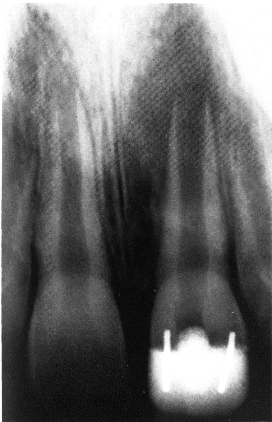
Fig. 1. Representative anterior tooth (#9) with an open apex and associated periapical radiolucency.

paste or calcium hydroxide in an aqueous methylcellulose base (Pulpdent, Brookline, MA, USA). The calcium hydroxide was placed upon completion of the initial instrumentation appointment (Fig. 2). Placement of the calcium hydroxide within the canal space was accomplished by packing the material with large files or pluggers or in some cases by using rotary compaction devices (14). The teeth were temporized between appointments.